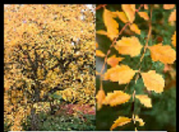
GOLDEN RAIN TREE